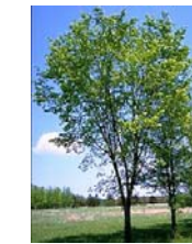
Valley Forge Elm