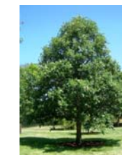
Swamp White Oak